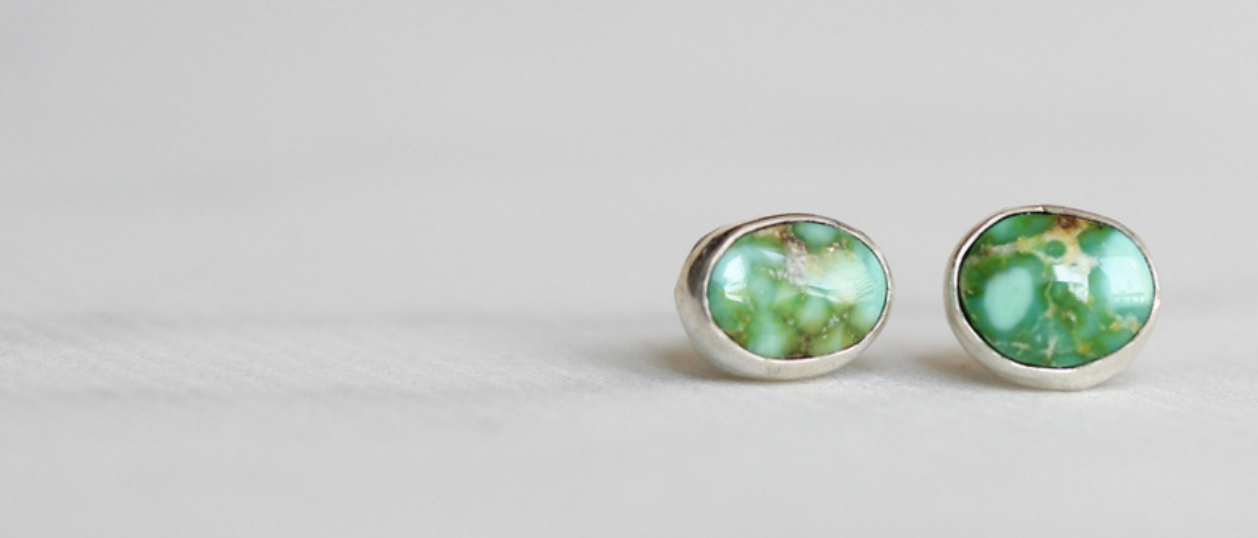
SONORAN GOLD DAINTY POSTS- $110