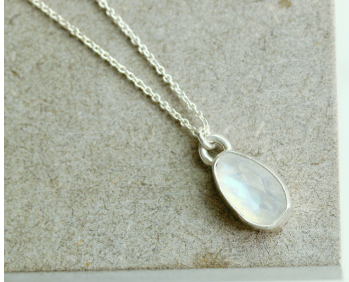
FACETED MOONSTONE NECKLACE, STERLING SILVER- $179