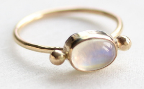
MOONSTONE ORB RING — from $178