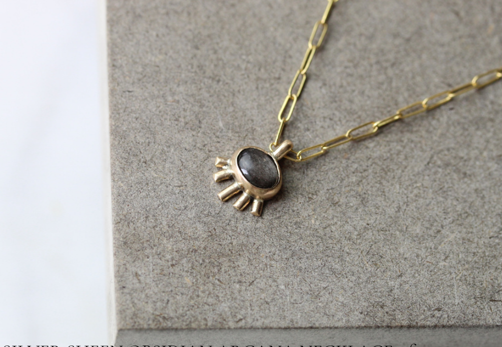
SILVER SHEEN OBSIDIAN ARCANA NECKLACE - from $295