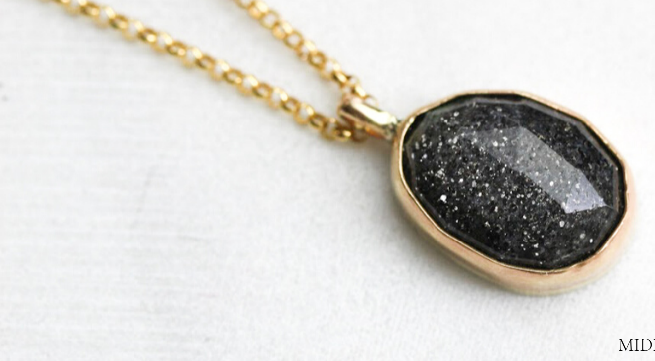
MIDNIGHT QUARTZITE NECKLACE - $311