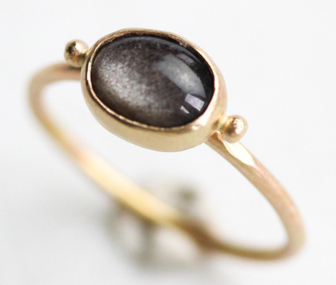
SILVER SHEEN OBSIDIAN ORB RING — $295